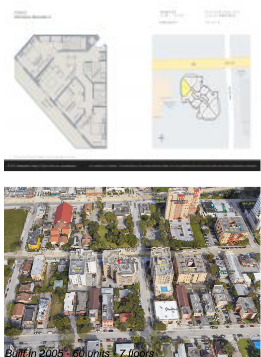
Built in 2005 - 60 units - 7 floors