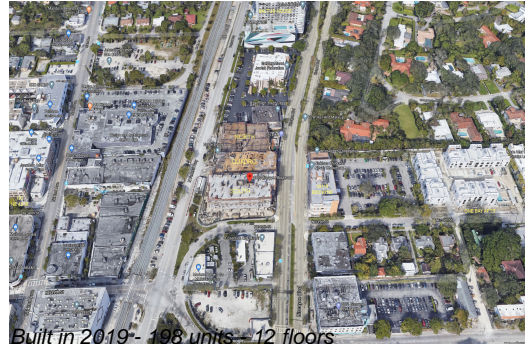
Built in 2019 - 198 units - 12 floors