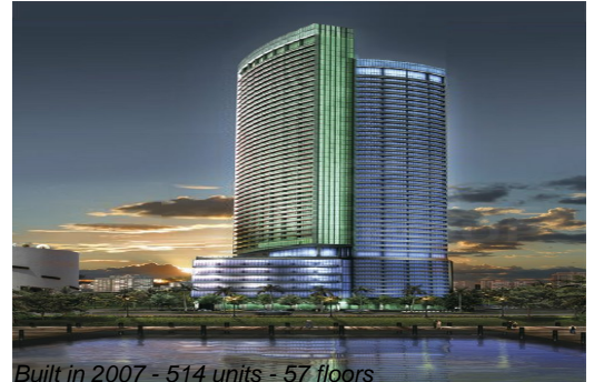
Built in 2007 - 514 units - 57 floors