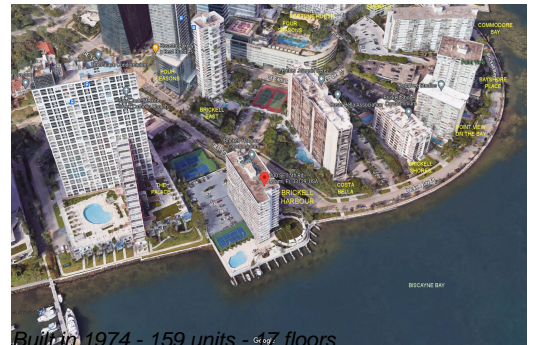
Built in 1974 - 159 units - 17 floors