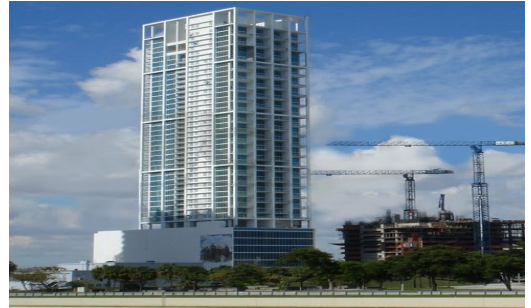
Built in 2007 - 200 units - 48 floors