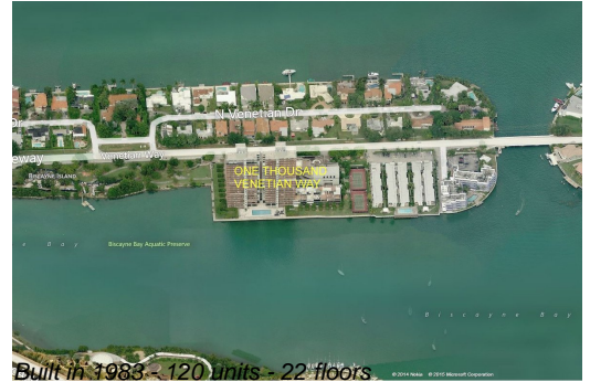
Built in 1983 - 120 units - 22 floors