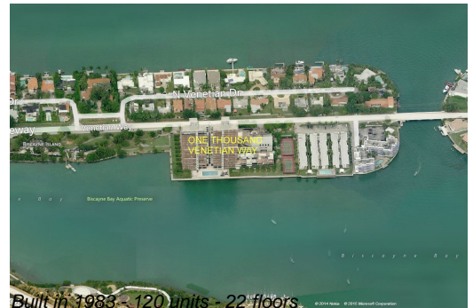
Built in 1983 - 120 units - 22 floors