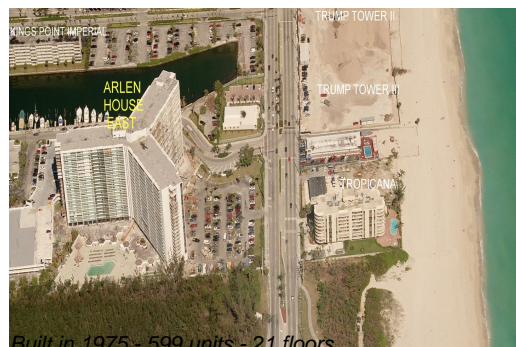
Built in 1975 - 599 units - 21 floors