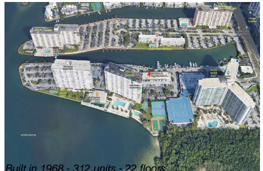
Built in 1968 - 312 units - 22 floors