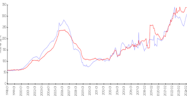
North Miami Beach vs Miami-Dade