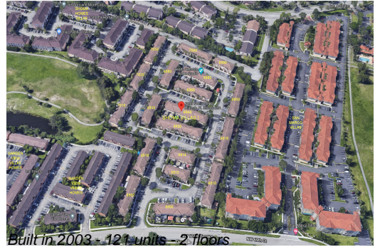
Built in 2003 - 121 units - 2 floors