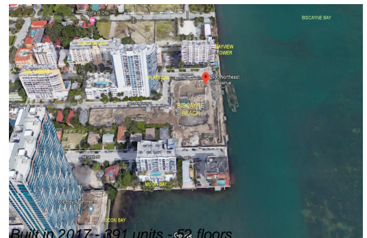
Built in 2017 - 391 units - 52 floors