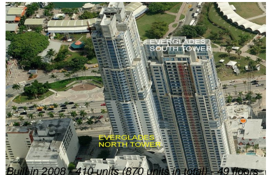
Built in 2008 - 410 units (870 units in total) - 49 floors