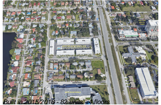
Built in 2015/2018 - 82 units - 4 floors