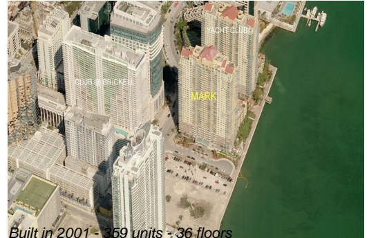
Built in 2001 - 359 units - 36 floors