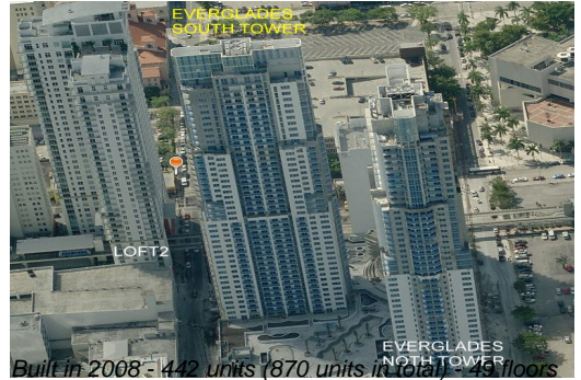
Built in 2008 - 442 units (870 units in total) - 45 floors