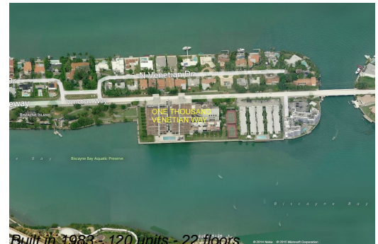
Built in 1983 - 120 units - 22 floors