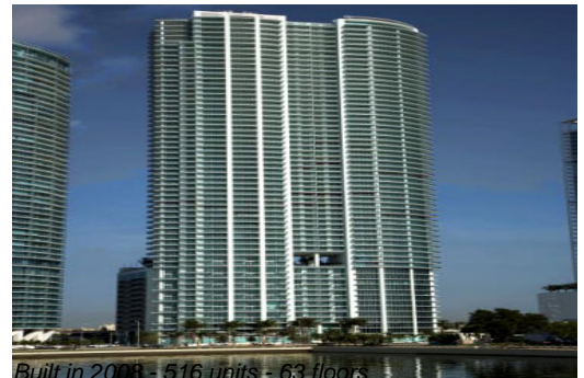
Built in 2008 - 516 units - 63 floors