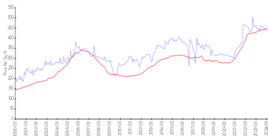
Atlantic 3 @ the Point vs Aventura