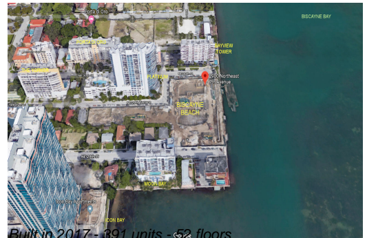
Built in 2017 - 391 units - 52 floors