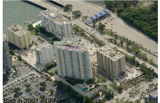
Built in 2001 - 199 units - 27 floors