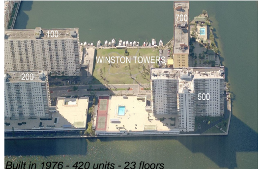
Built in 1976 - 420 units - 23 floors