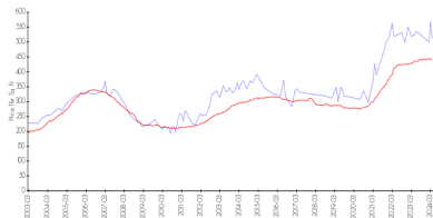
Peninsula 1 vs Aventura