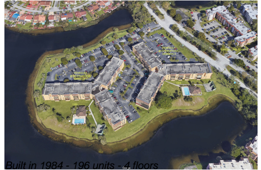
Built in 1984 - 196 units - 4 floors

The above valuated price is a baseline figure that does not take into account any specific renovation, upgrade, split, merge, or deterioration of the unit.