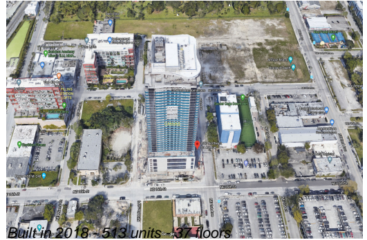
Built in 2018 - 513 units - 37 floors