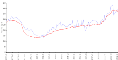
Metropolis 1 vs Pinecrest