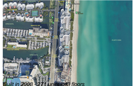
Built in 2008 - 271 units - 43 floors