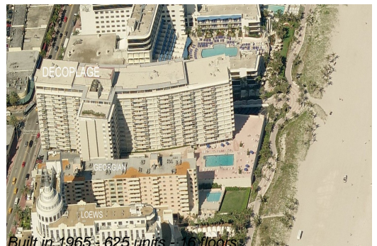
Built in 1965 - 625 units - 10 floors