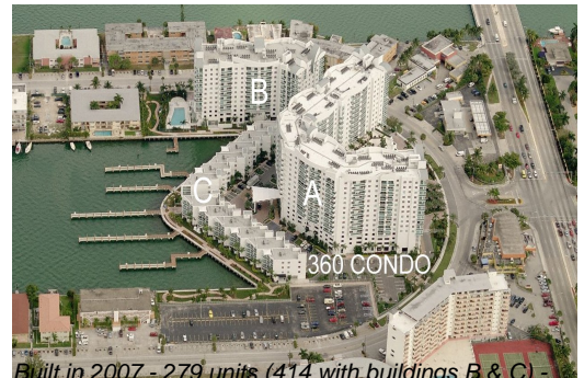
Built in 2007 - 279 units (414 with buildings B & C) - 15 floors