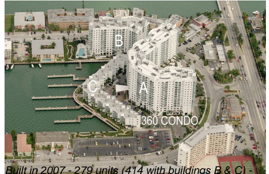
Built in 2007 - 279 units (414 with buildings B & C) - 15 floors