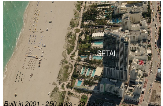
Built in 2001 - 250 units - 39 floors