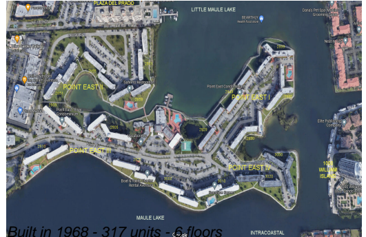
Built in 1968 - 317 units - 6 floors