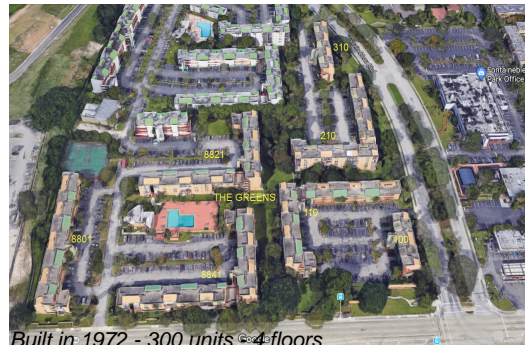
Built in 1972 - 300 units ~4 floors