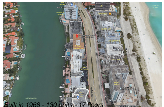
Built in 1968 - 130 units - 17 floors