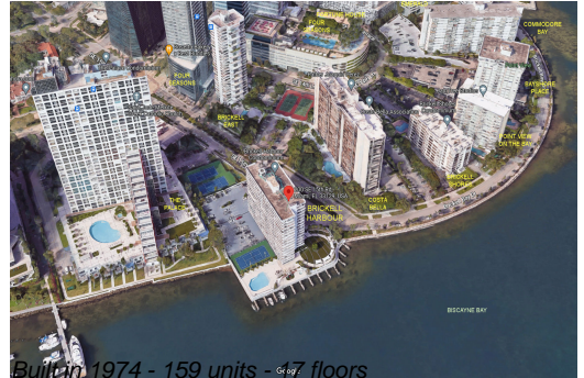
Built in 1974 - 159 units - 17 floors