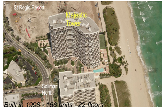
Built in 1998 - 166 units - 22 floors