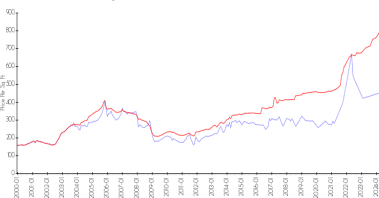
Island Pointe vs Bay Harbor