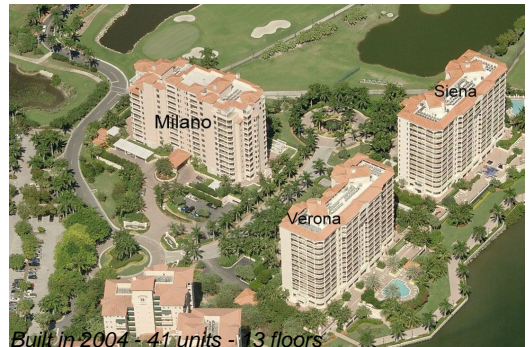
Built in 2004 - 41 units - 13 floors