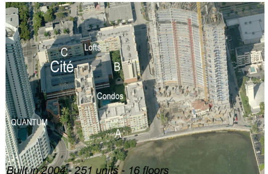
Built in 2004 - 251 units - 16 floors