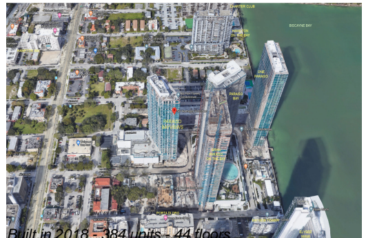
Built in 2018 - 384 units - 44 floors