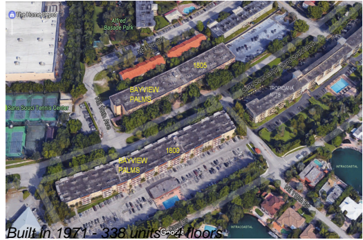
Built in 1971 - 338 units, 6 stories