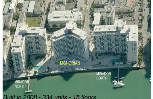
Built in 2008 - 334 units - 15 floors