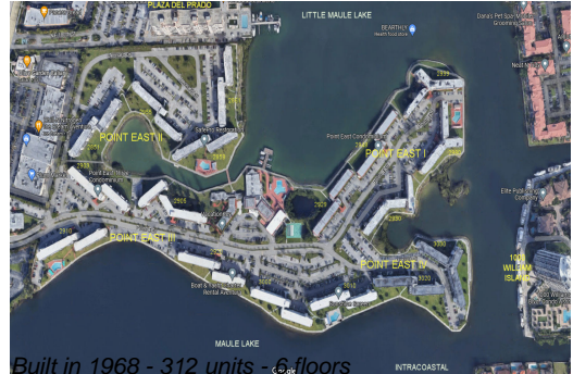
Built in 1968 - 312 units - 6 floors