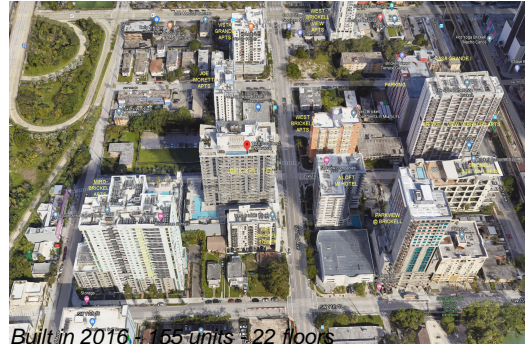
Built in 2016 - 155 units - 22 floors