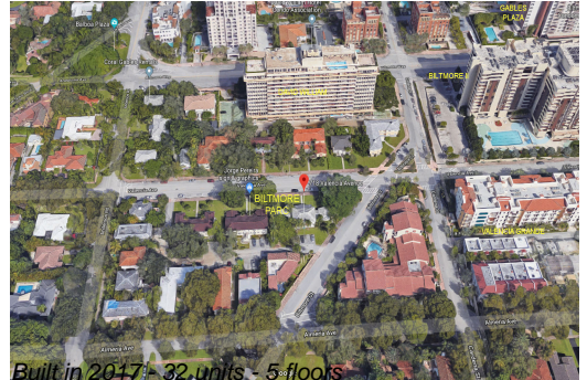
Built in 2017 - 32 units - 5 floors