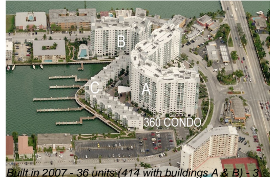
Built in 2007 - 36 units (414 with buildings A & B) - 3 floors