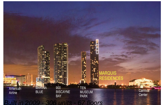
Built in 2009 - 306 units - 67 floors