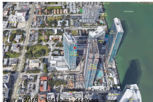
Built in 2018 - 384 units - 44 floors