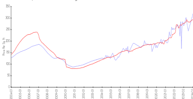
Courtyards at the Crossing vs Kendale Lakes