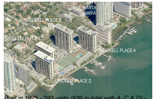
Built in 1975 - 293 units (939 in total with A, C & D) - 26 floors