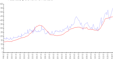
Atlantic 2 @ the Point vs Aventura